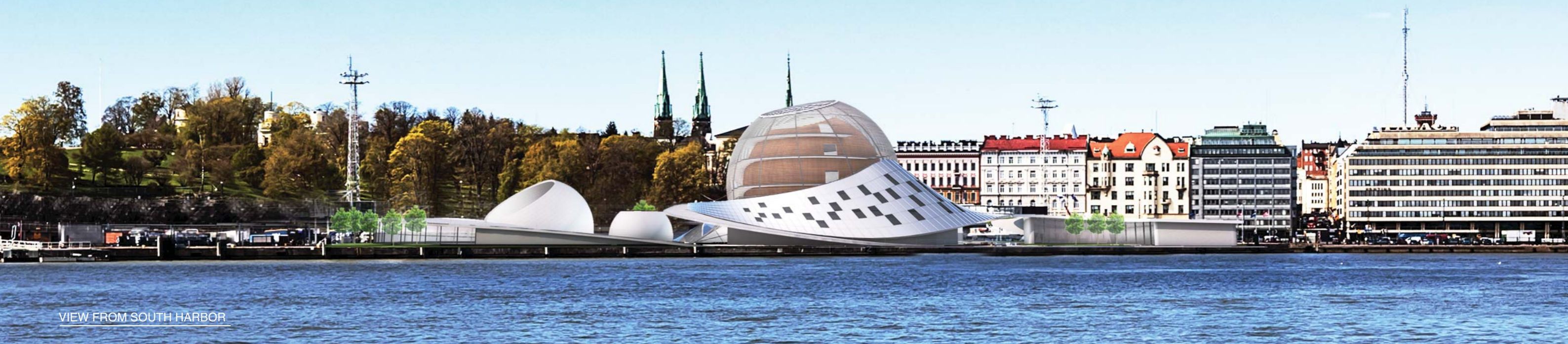
VIEW FROM SOUTH HARBOR